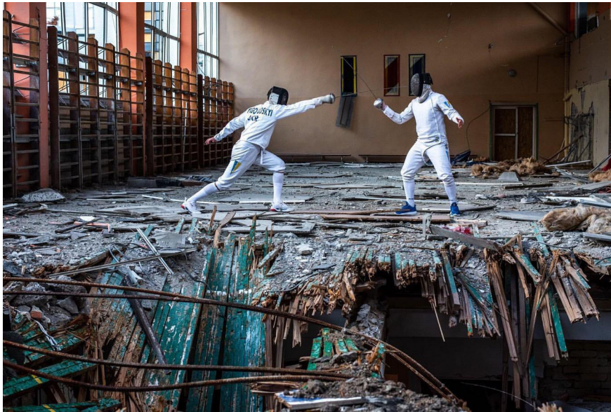
Figure 2 Sports club ‘Unifecht’ (Kharkiv city, Ukraine) after rocket attacks.