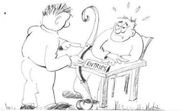
Do you have a Recurve Unlimited Division?

Red: The second scoring colour on the Indoor/Outdoor target face, starting at the centre of the target.