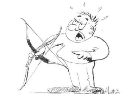
I would like to enter the Crossbow section.

Crossbow: A bow that is fitted horizontally on to a stock, and is shot in a fashion similar to a rifle.