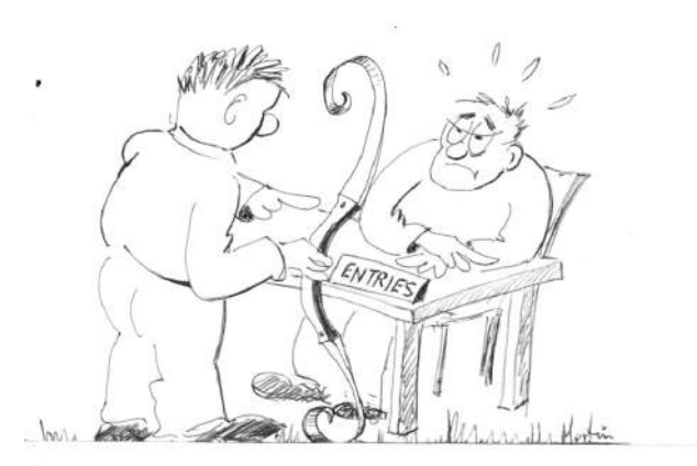
Do you have a Recurve Unlimited Division?

Red: The second scoring colour on the Indoor/Outdoor target face, starting at the centre of the target.