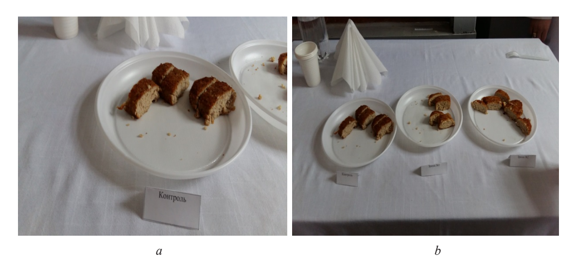
Fig. 4. Tasting of functional cutlets: a - look of control cutlets; b - look of elaborated samples

Having analyzed all parameters by correspondent criteria, the highest results were established, 12 experts took part in the experiment.