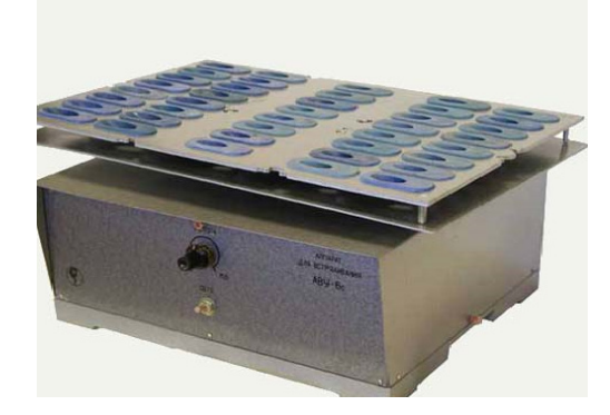
Fig. 1. Shuttle-apparatus for raw material shaking