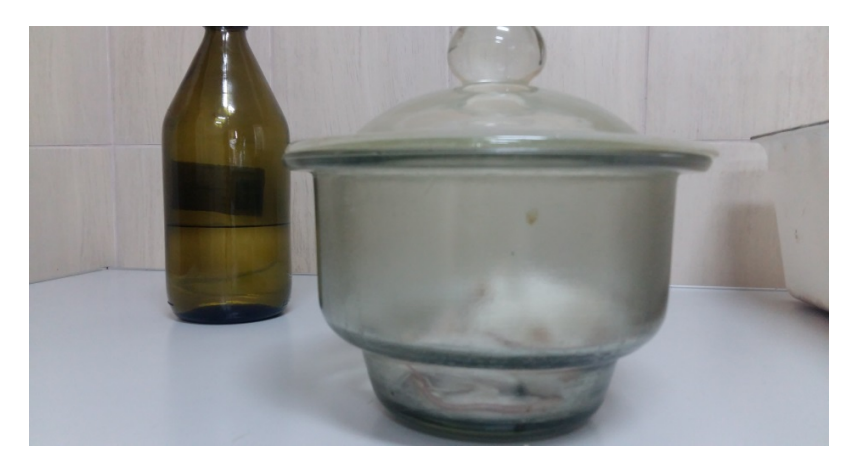
Fig. 2. Pouring of laboratory mice

The toxicity was assessed by the following criteria: